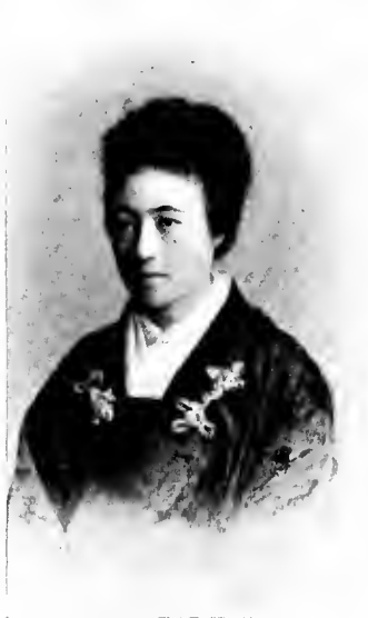
MADAME SADA YACCO (p. 67)